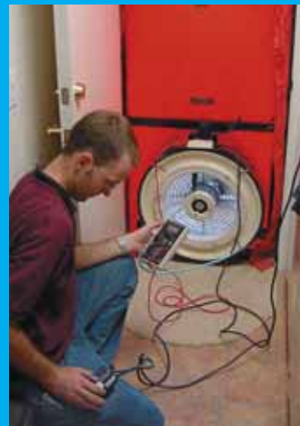
TECHNICIAN PERFORMING A BLOWER DOOR TEST

Your contractor is participating in a Home Performance with ENERGY STAR program with a local sponsor. That sponsor is